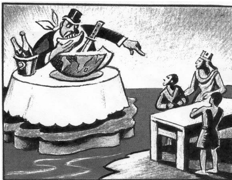
An Italian cartoon showing Britain (top left) criticising Italy (bottom right) over Abyssinia. This cartoon was published in October 1935 in a newspaper founded by Mussolini.