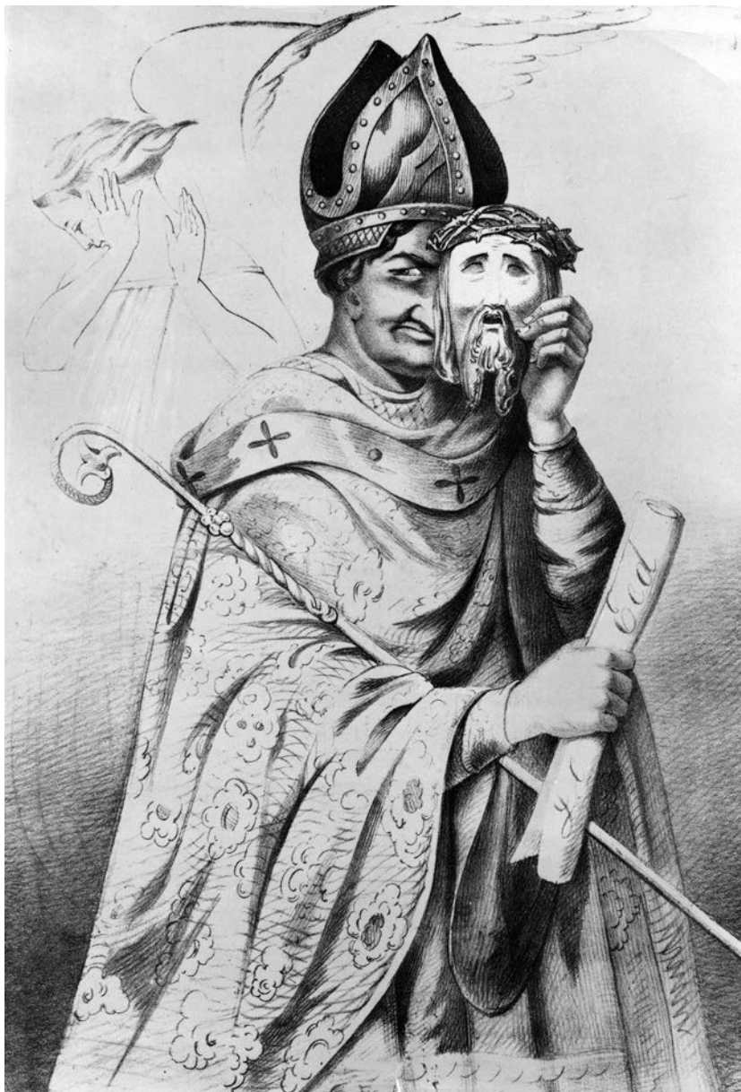
A cartoon of Pope Pius IX published in 1852. He is holding a mask of Christ.