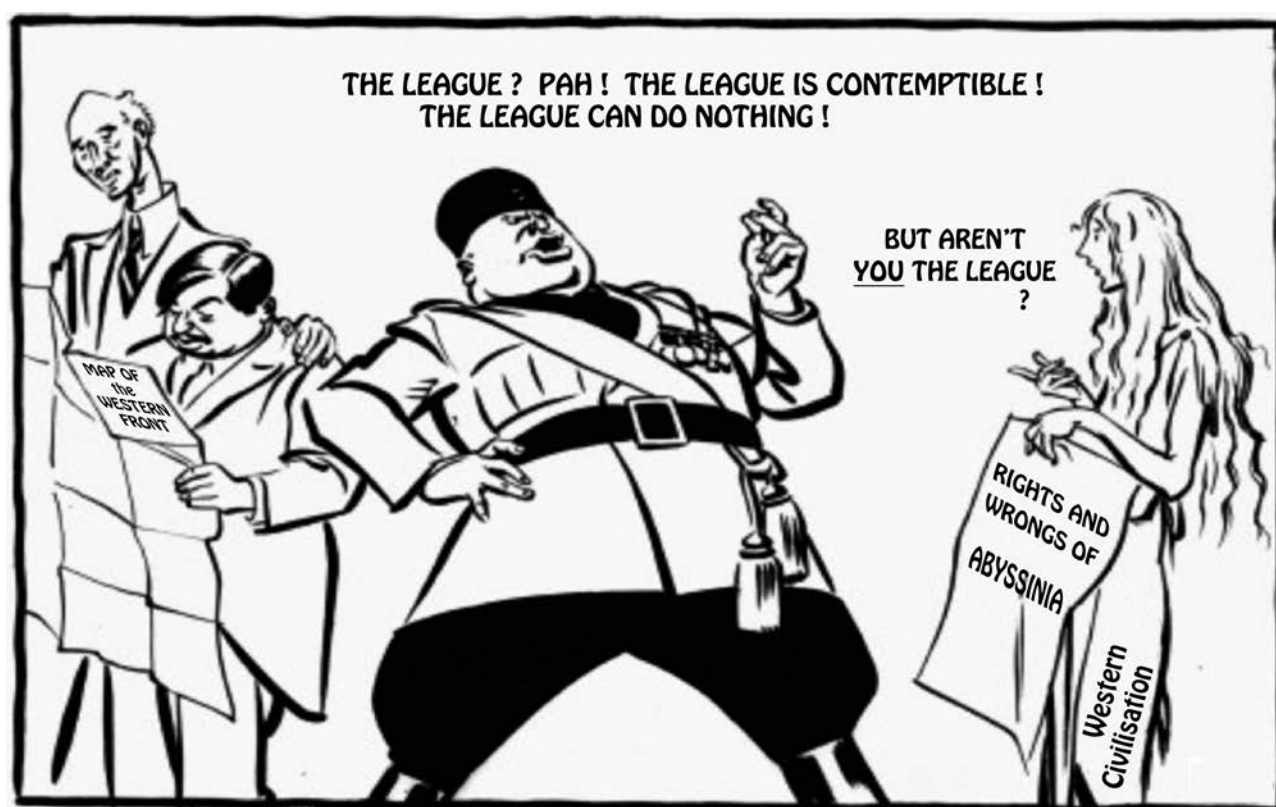
A British cartoon published in February 1935.